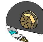
DETAIL B SCALE 1 : 4

5/8 NC X 1 3/4" GR. 8 BOLT WITH (2) 5/8" GR. 8 WASHERS AND 5/8" NC GR. C STOVER NUT (6) PLACES (SUPPLIED)