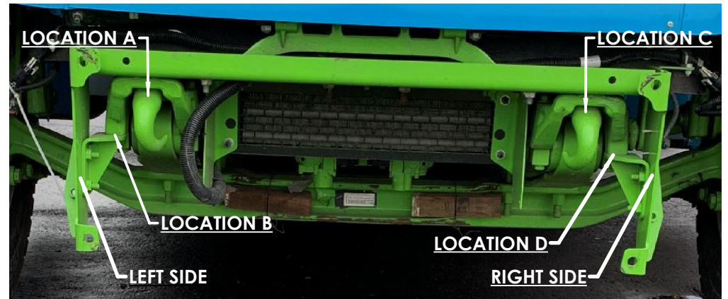
FRONT VIEW OF TRUCK